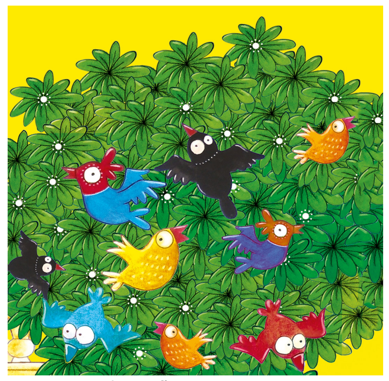
Many trees have flowers. I like spring!