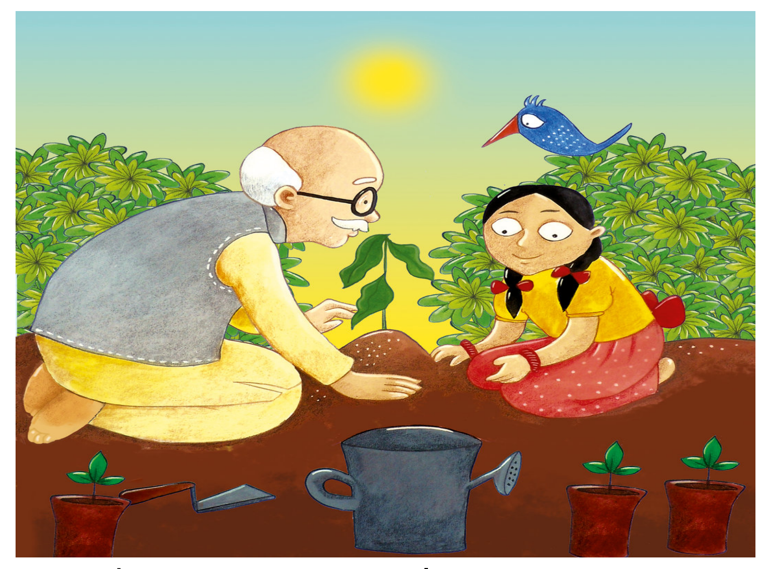
Grandpa wants me to plant a tree.