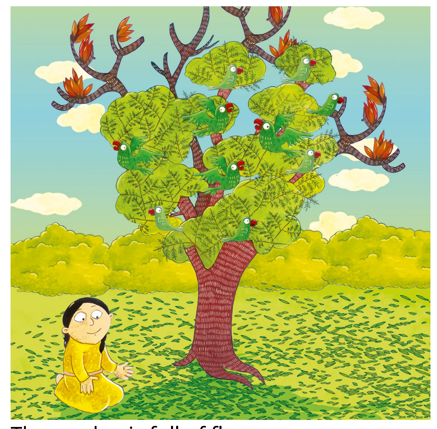
The garden is full of flowers. I like the yellow roses the best and Grandpa likes the white jasmine. There is a carpet of leaves under some trees.