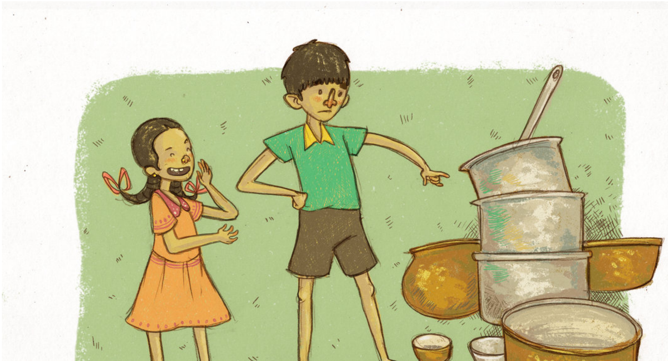
ollas y sartenes