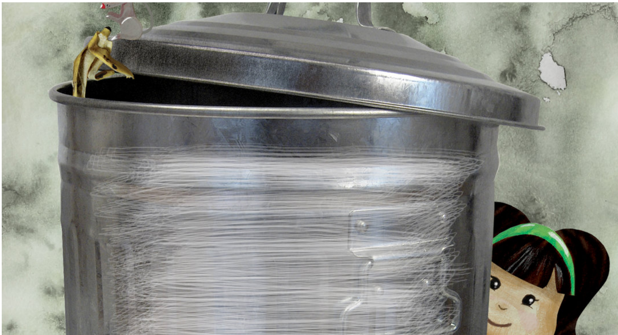
cubo de basura