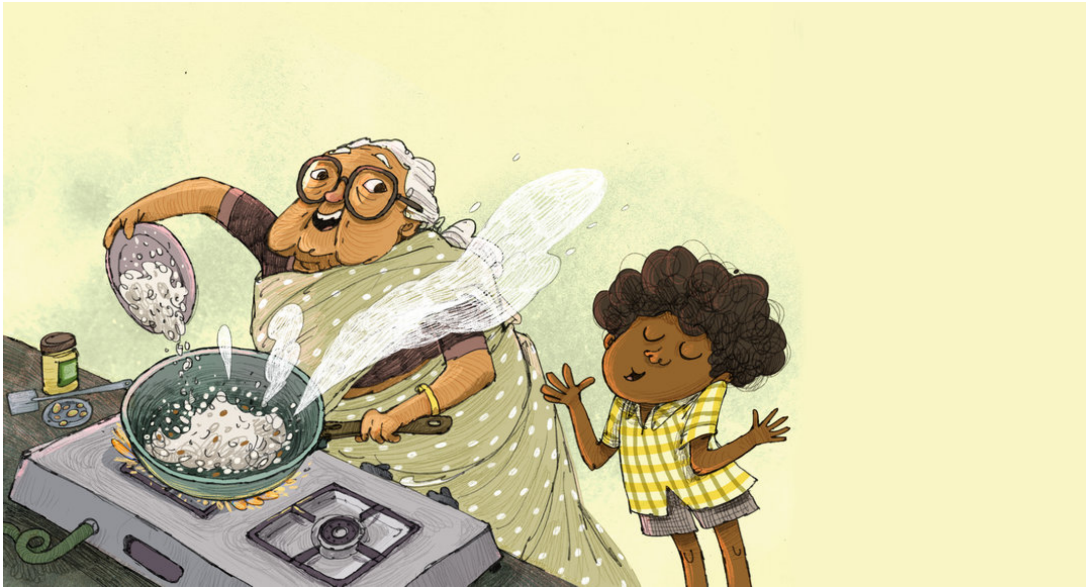
cocina de gas