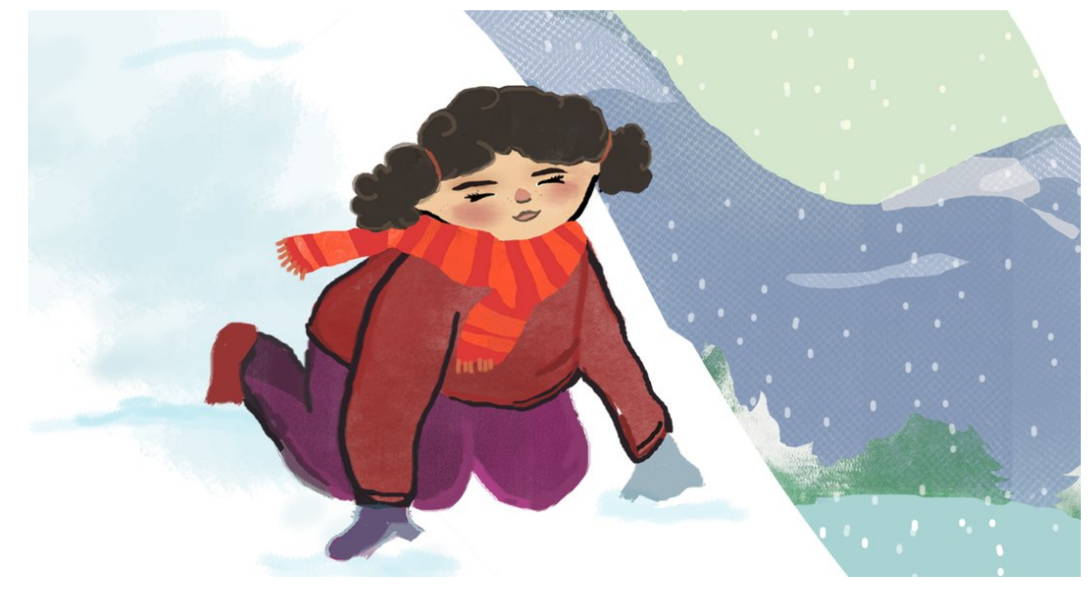
Todos buscaron, pero no había señales de Kelly.