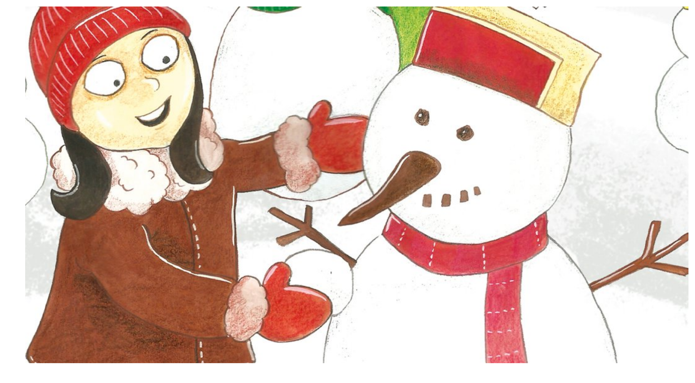
¡hasta que tropezaron con un muñeco de nieve! "¡Ayuda!" dijo el muñeco de nieve. Estaban sorprendidos.