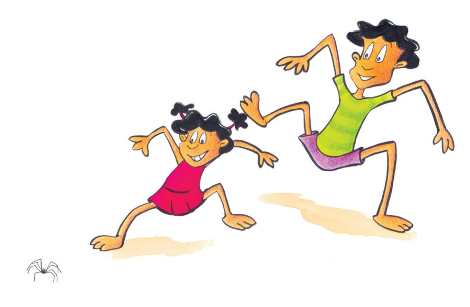
Sonu y Monu miran y saltan en el tren. Su madre les pide que jueguen.