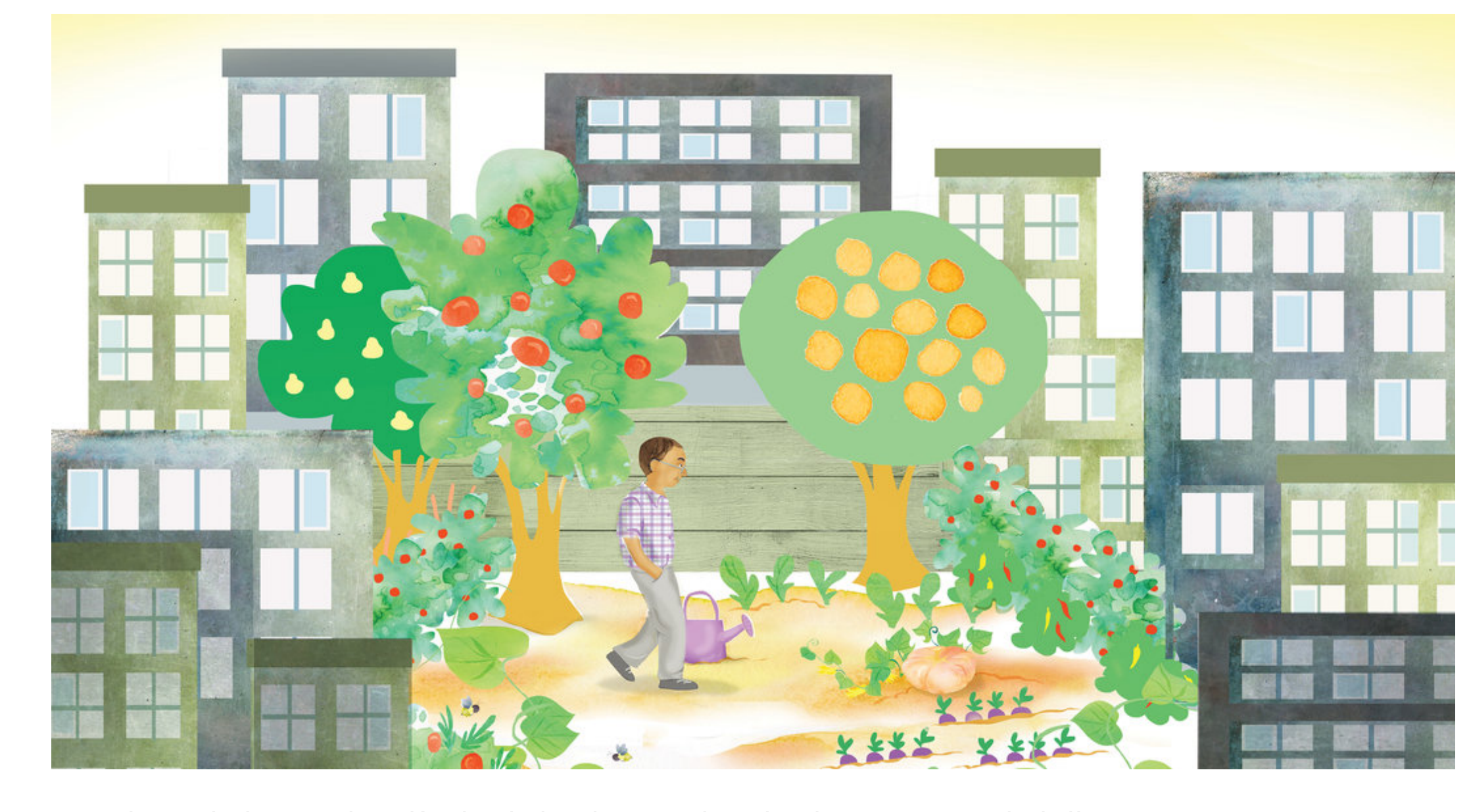
En la ciudad, esta el jardín de el abuelo Farouk rodeado por casas y ladrillos.