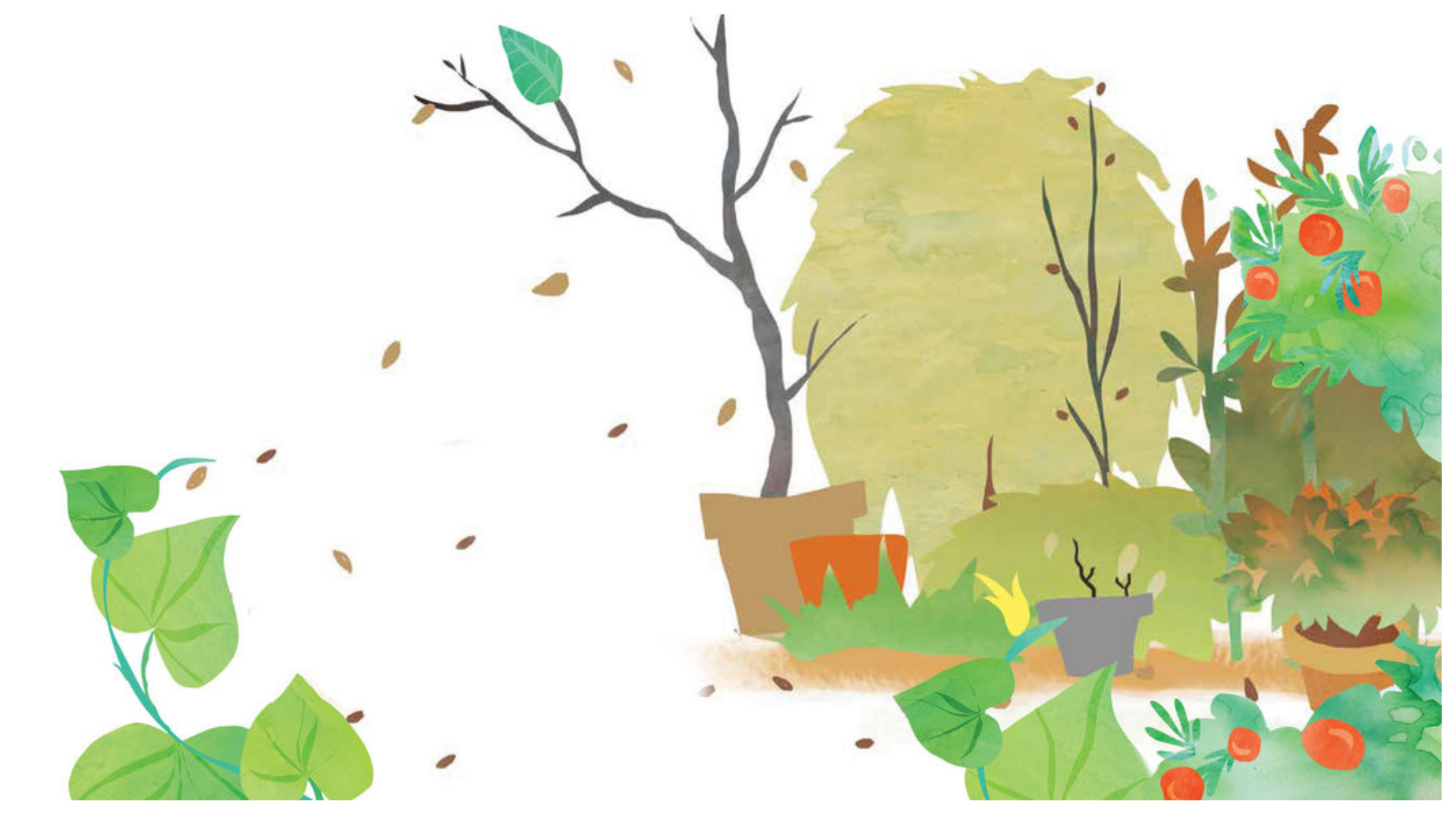
"Mira" le dijo el abuelo. "Unas plagas se están comiendo las plantas."