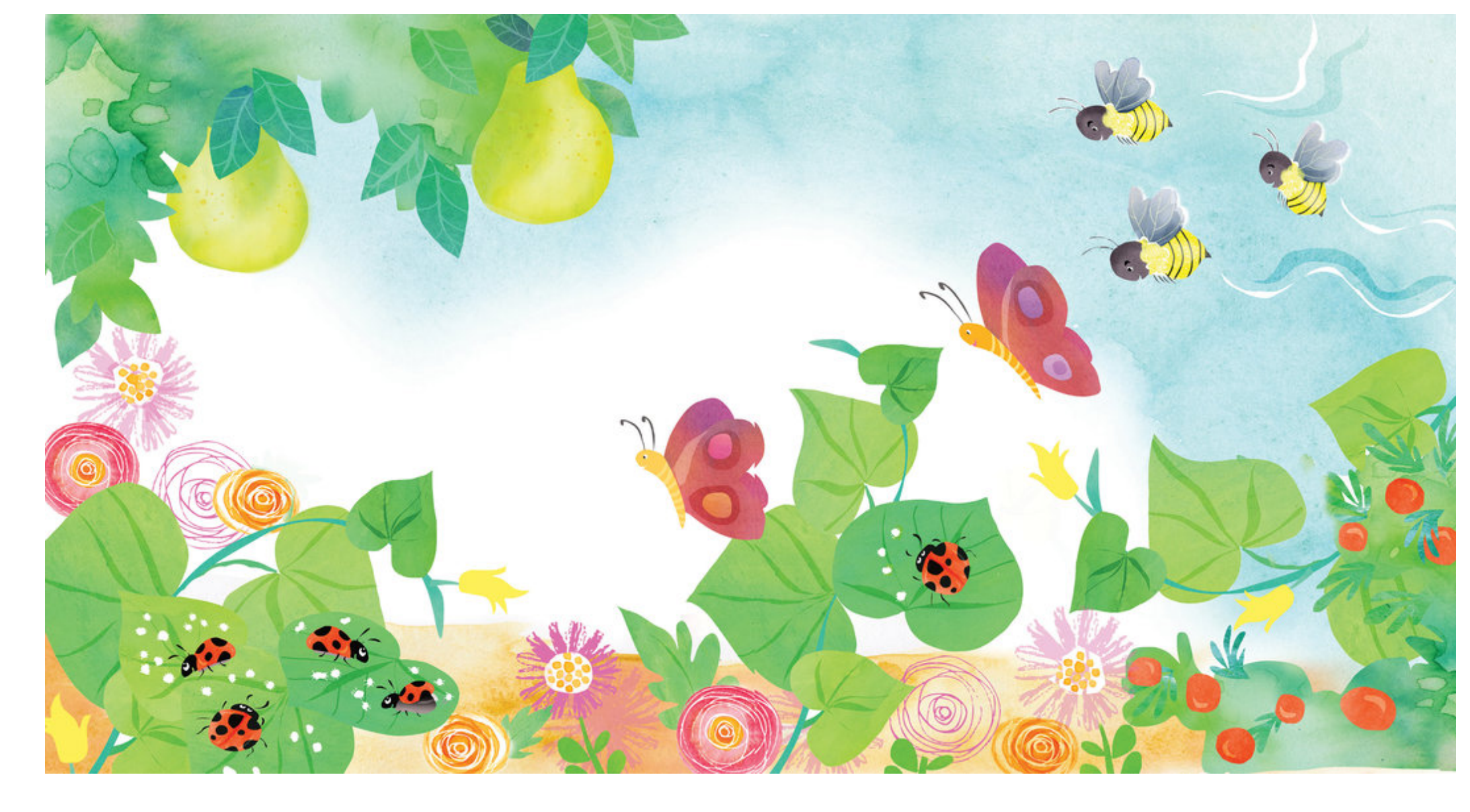
Las mariquitas se comieron la plaga, luego las flores florecieron.