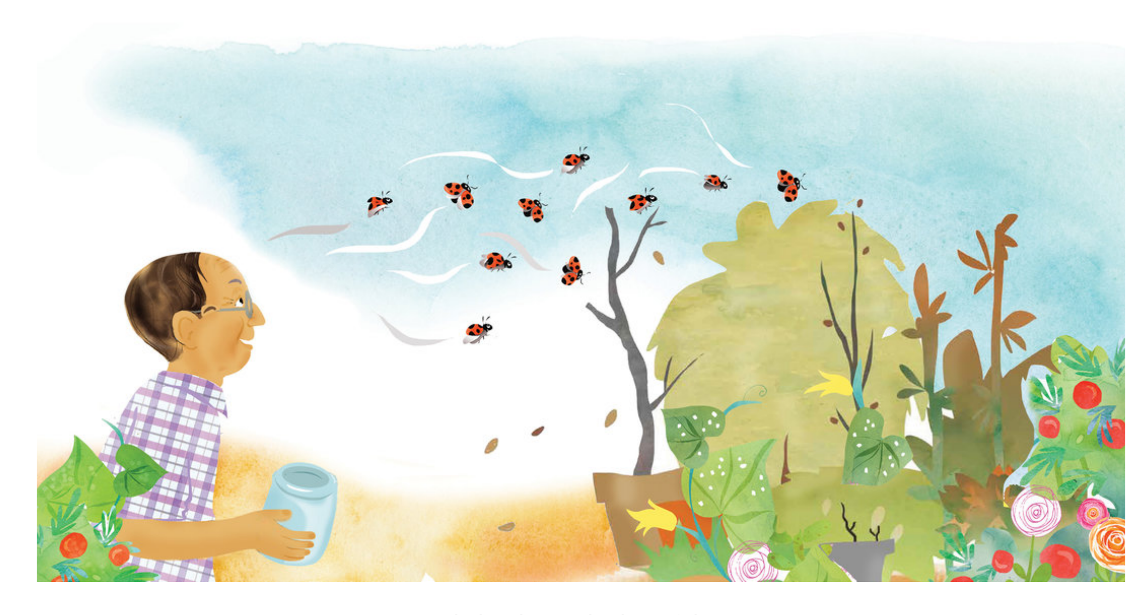
El abuelo estaba bien feliz. Las mariquitas tenían mucha hambre!