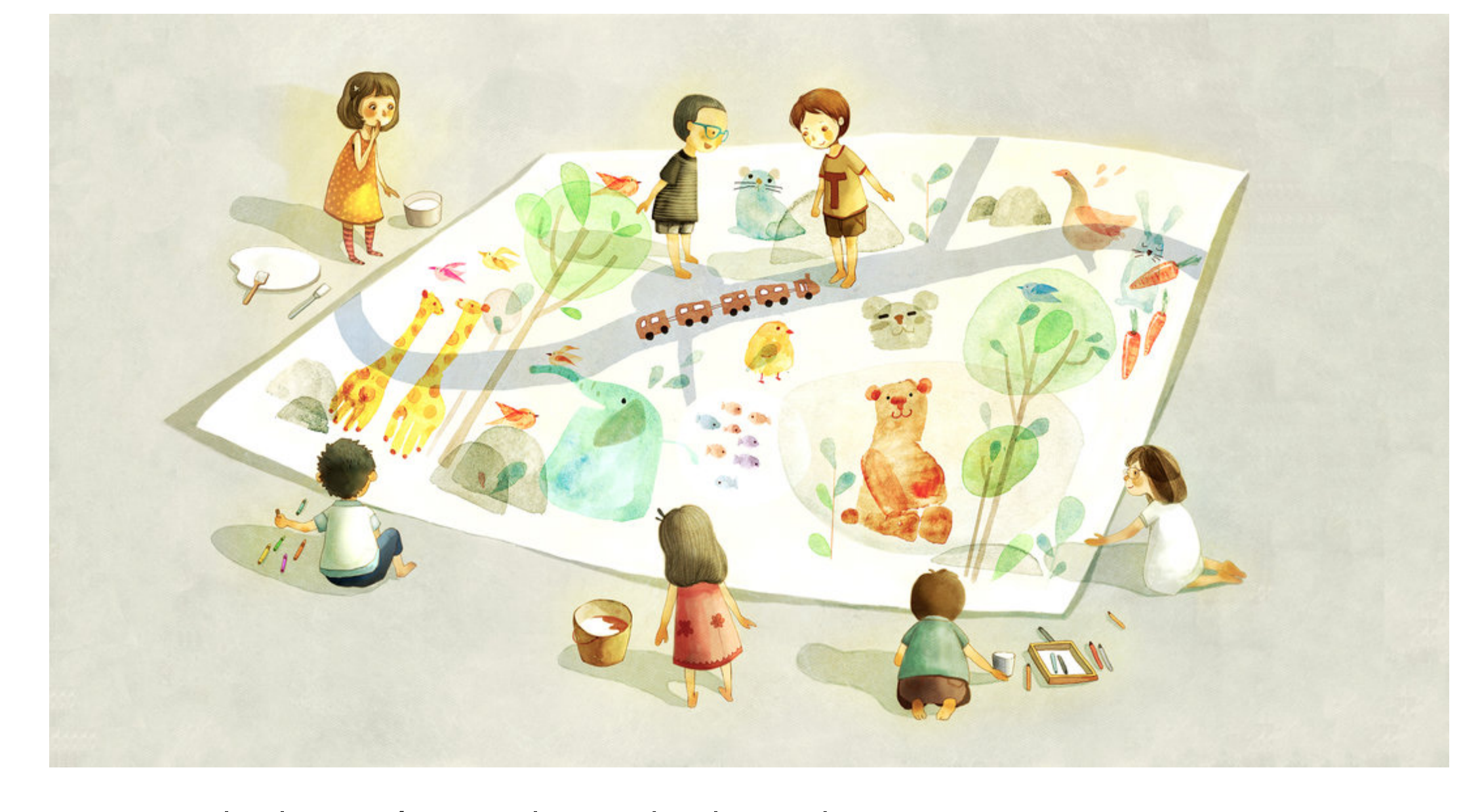
¡Esta es la clase más genial en todo el mundo! Juntos, los niños pintan un cuadro maravilloso.