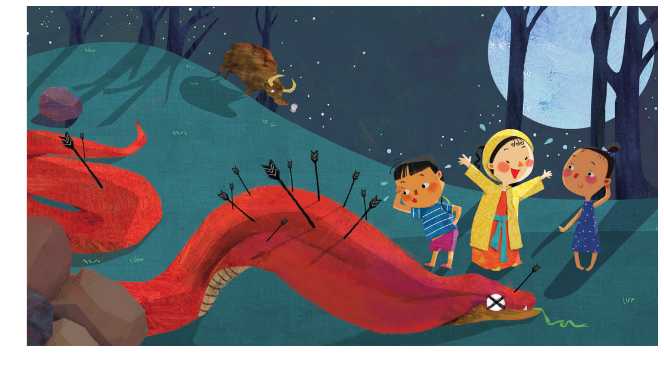
¡Finalmente, rescatan a la princesa!