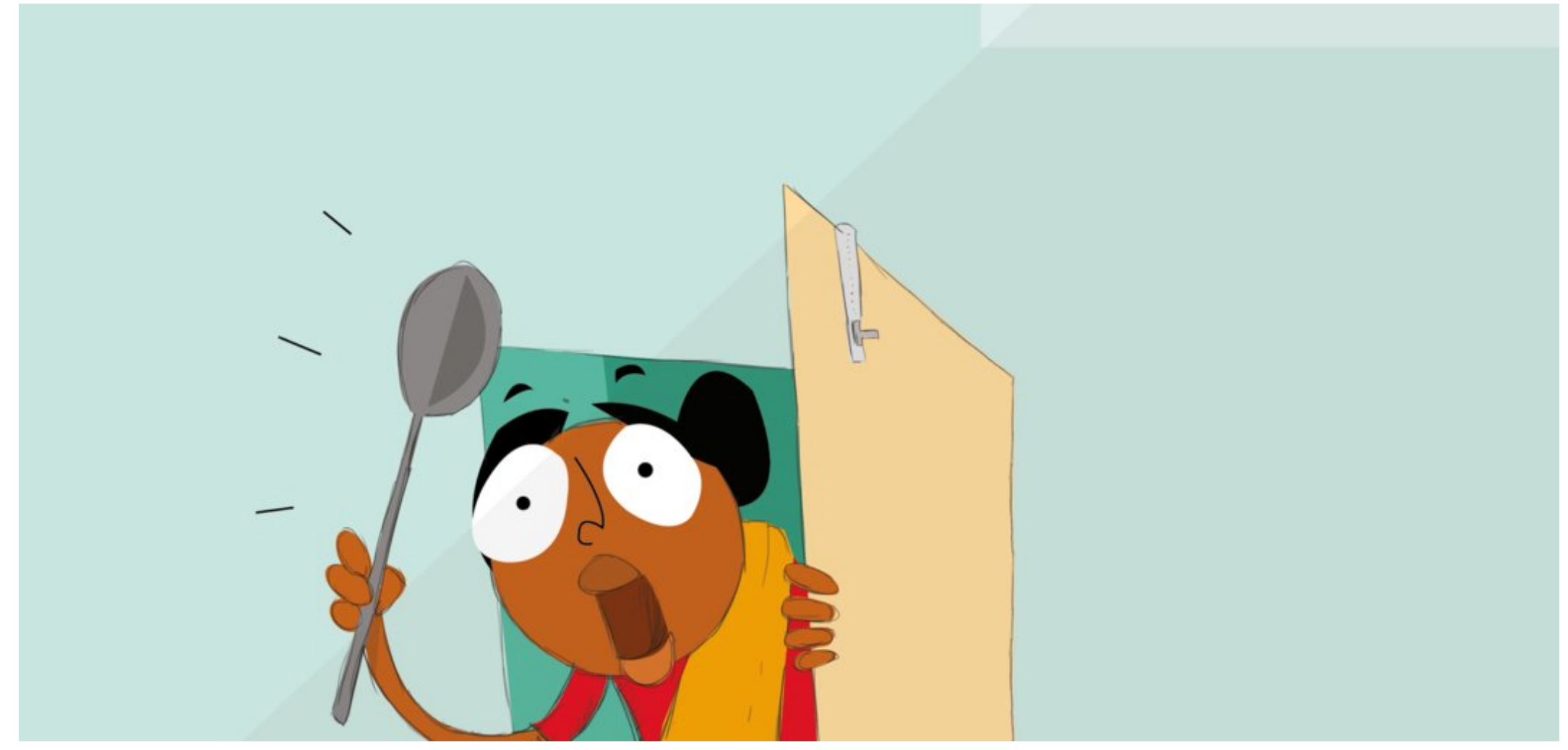
What if — I begin, but Amma shouts, "Shyam, you'll be late, what are you thinking about?"