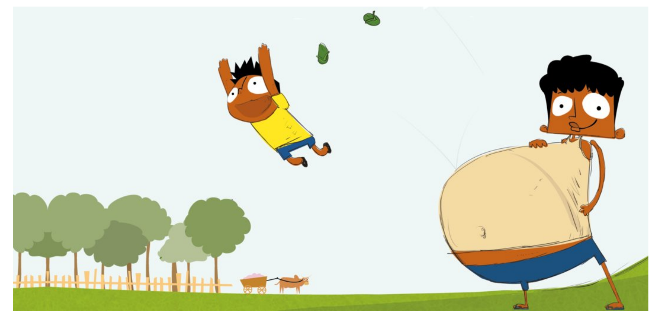
What if my belly was as round as could be? All my friends could jump and bounce off me!