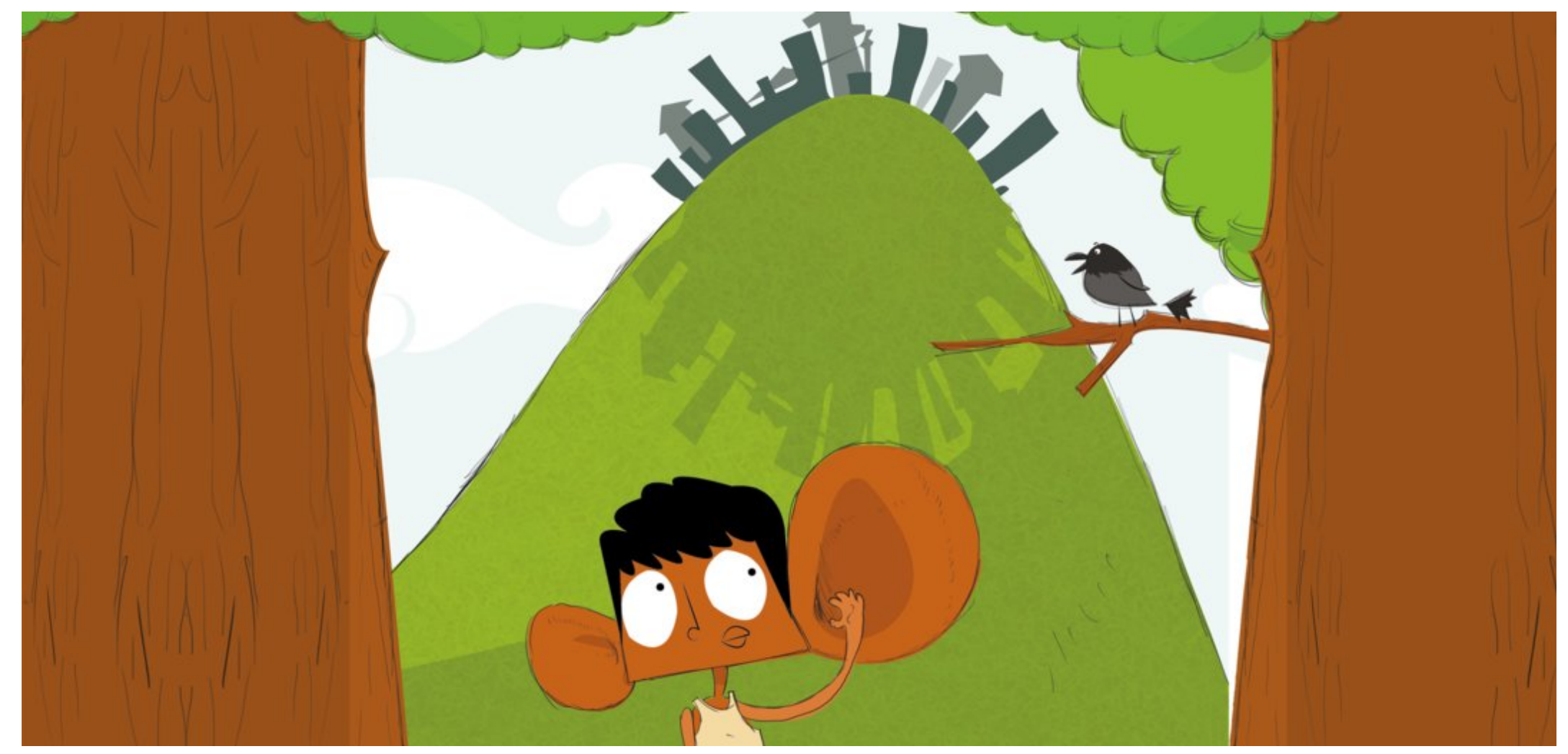
What if I had big and floppy ears? I could hear everything, far and near!