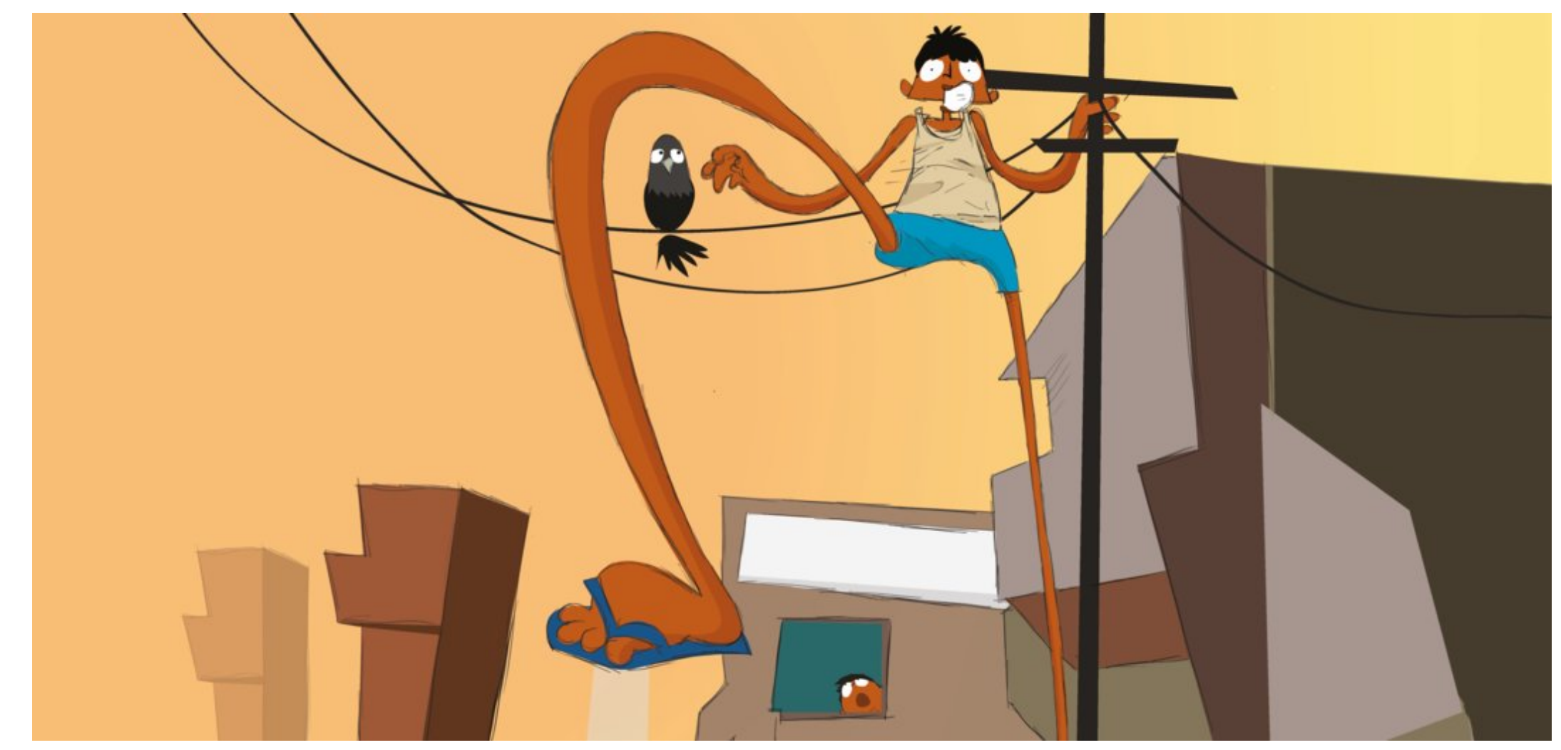
What if my legs were as tall as trees? My school building would only come up to my knees!