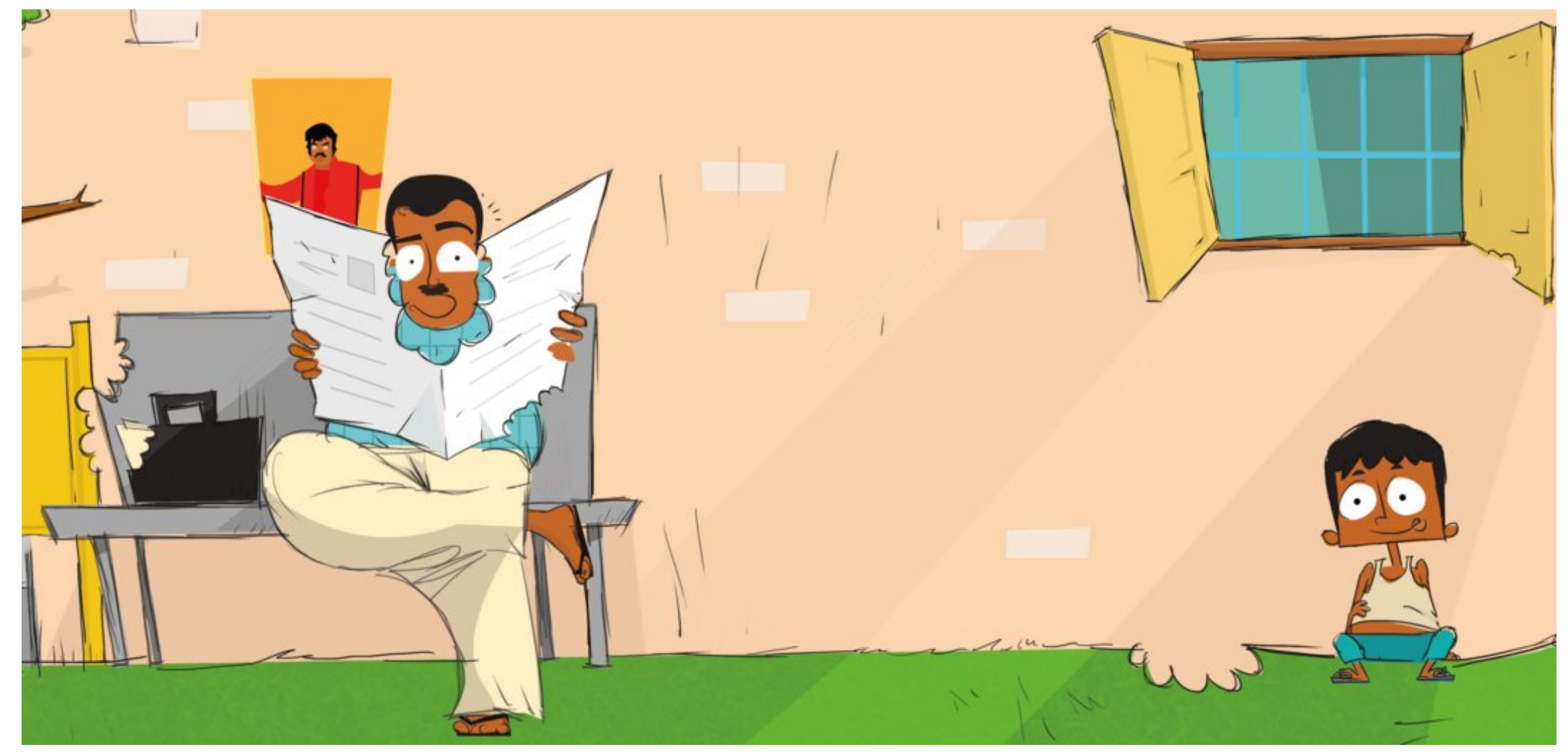
What if there was nothing too hard for my teeth? Think of all the things I could eat!