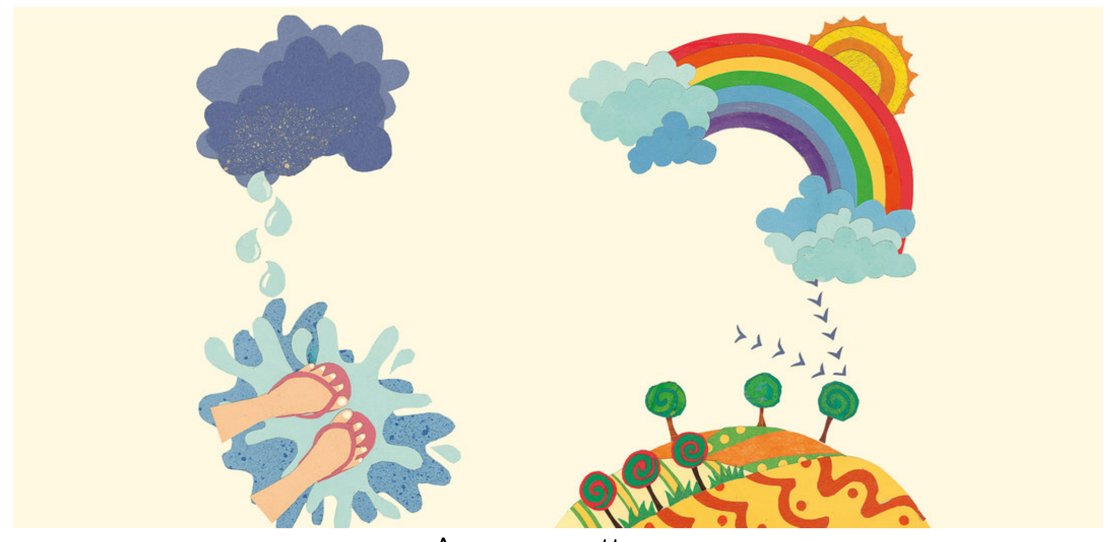
Anu sees patterns and shapes everywhere, nothing at all can escape her stare!