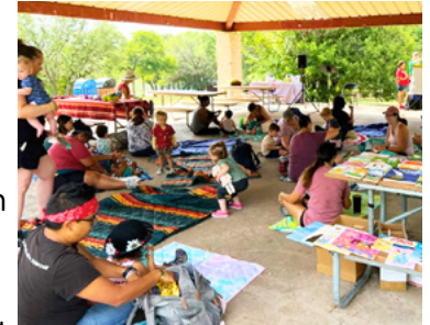
Children and families participating in story time and receiving books from BookSpring at Playdates In the Park hosted by the Austin Parks Foundation

pandemic has changed the literacy landscape for children and families. It is encouraging, however, that parents and caregivers surveyed still feel that reading is important for their children's happiness and success, as well as their own.