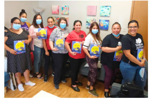
Another cohort of parents from Todos Juntos Learning Center completing BookSpring's Parent Book Club .