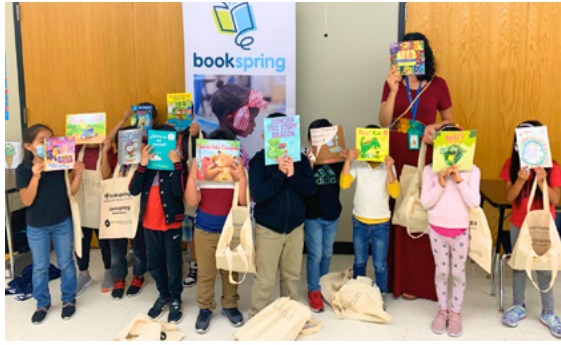
Teacher and class showing off their books they received as part of BookSpring's Summer Success program.