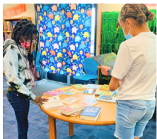
Two children at Overton Elementary picking books to take home with them as part of our Books for Me program.

Children's books owned at home went down significantly from last year, 20+ books decreasing to 16% from 24% in 2021. BookSpring sees this