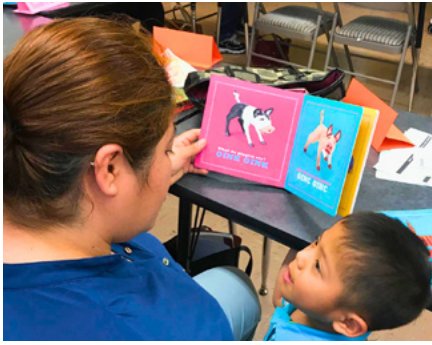
Mother reading her child a board book she received from BookSpring as part of our Early Books for Me program.