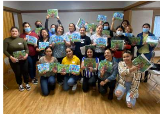
Another cohort of parents from Todos Juntos Learning Center completing BookSpring's Parent Book Club .