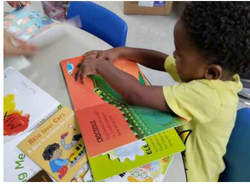
Child flipping through a board book they received at our Early Books for Me program hosted by Child, Inc.