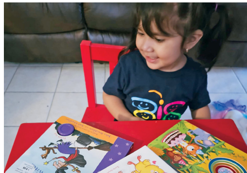
Child looking at the books they received through Books Beginning at Birth program.