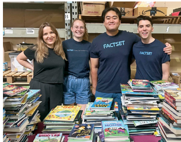
FactSet sorting books volunteering at BookSpring warehouse