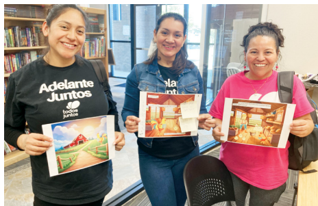
Todos Juntos interns holding up portions of their finished book, Just A Minute .

BookSpring partnered with Todos Juntos to create a unique and meaningful children's book creator internship, where passionate participants stepped into the