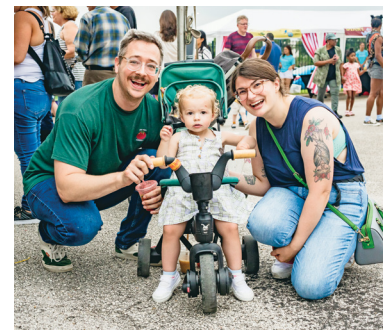
Young family enjoying their time at BookSpring Fest 2024