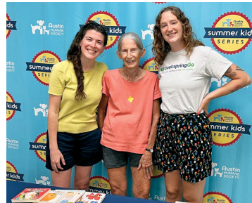
BookSpring staff and volunteers at Austin Humane Society event

Our dedicated volunteers are indispensable to our mission. We sincerely thank everyone who volunteered this year. Our volunteers have played a pivotal role in our programs helping countless children to experience an enriched world of reading.