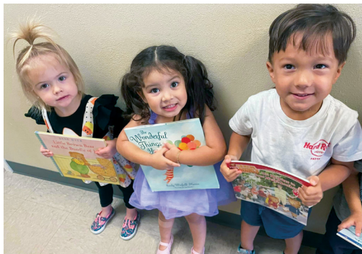
Children at Tiny Sprouts Academy holding up their new books.