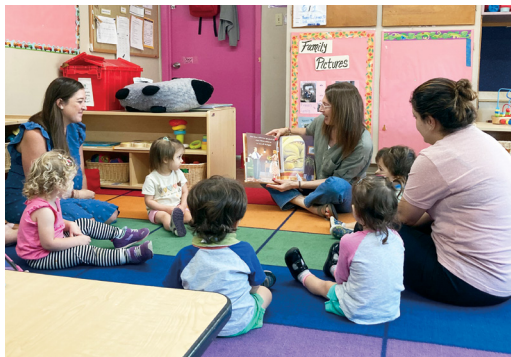
Partner reading aloud to children at Trinity CDC through our Early Books for Me program.