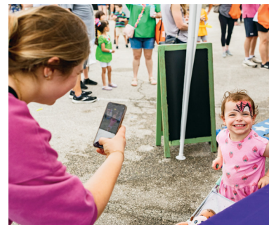
Child smiling with her new face paint from Silly Sparkles at BookSpring Fest 2024

We proudly distributed over 800 books, directly placing them into the hands of children and families. Additionally, with the participation of more than 30 special guest readers, children were captivated by stories that ignited their imaginations.