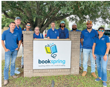
Linbeck volunteers at BookSpring headquarters